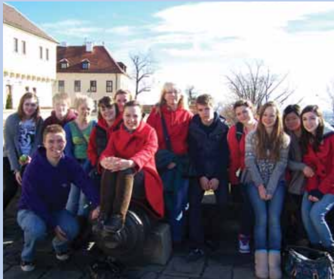
All abroad: Outside the Spilberk Castle in Brno.

TEN Year 12 students recently embarked on the third leg of our Comenius project, visiting Brno in the Czech Republic. They spoke at a conference about the environment, and were given the opportunity to sample life with a Czech family.