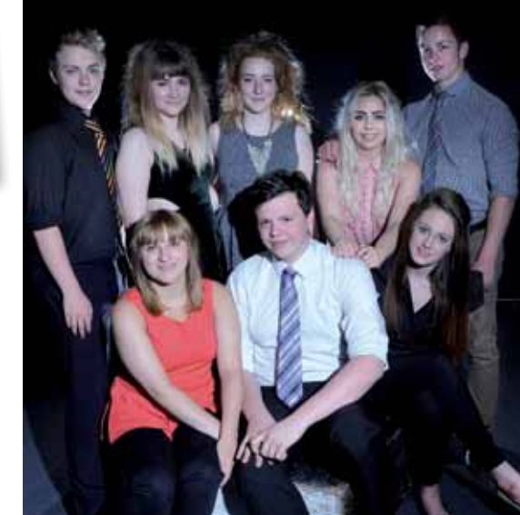
DNA in the spotlight: Members of the cast.