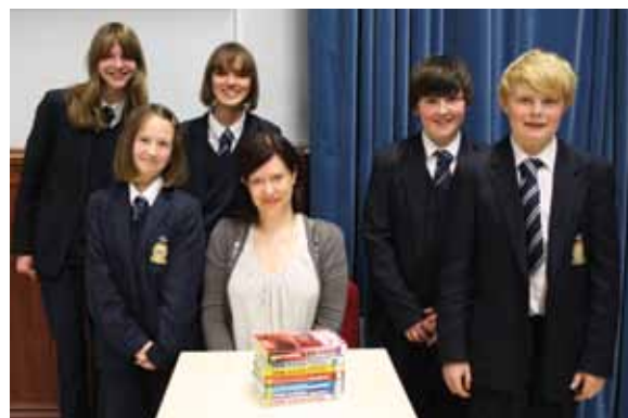
Write on! The author Sophie McKenzie with our students.