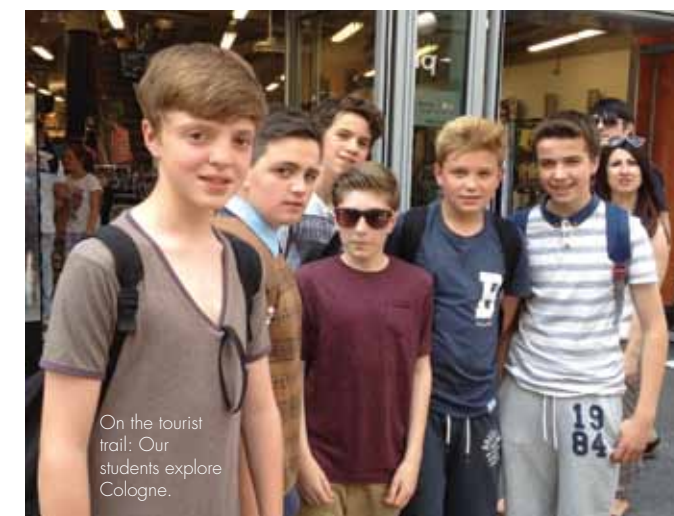
On the tourist trail: Our students explore Cologne.

Students in Years 10-13 spent a week with their German Exchange partners in Aachen, before welcoming them back to Otley.