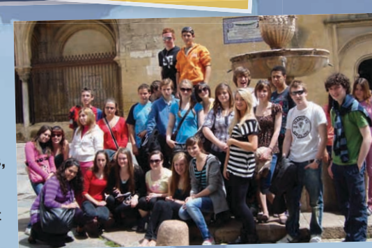
Enjoying the sunshine: Year 11 pupils in Cordoba with their Spanish partners.

In May, 57 Year 7 pupils visited Barcelona, taking in Camp Nou stadium, the Sagrada Familia, Parc Guell and Port Aventura. A few days later, pupils in Year 8 also flew to Barcelona, where they found time to visit our other Spanish partner school, IES Montserrat.